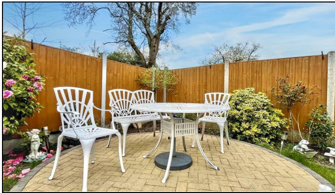
Cater Drive, Sutton Coldfield, B76 2PS